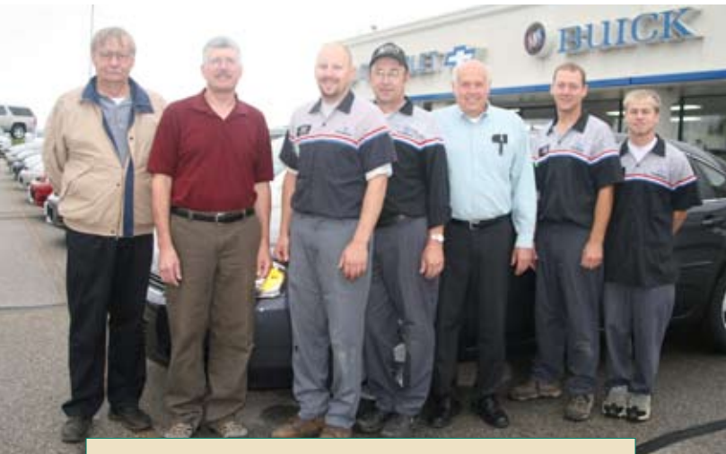
Lewiston Auto, Lewiston, Minnesota