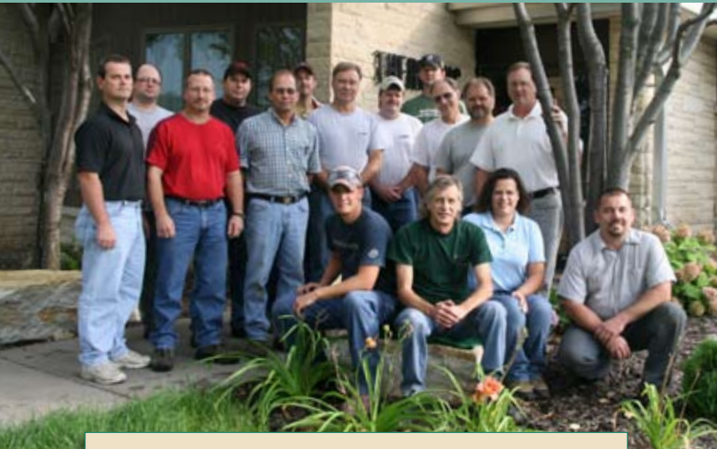
Thern, Inc., Winona