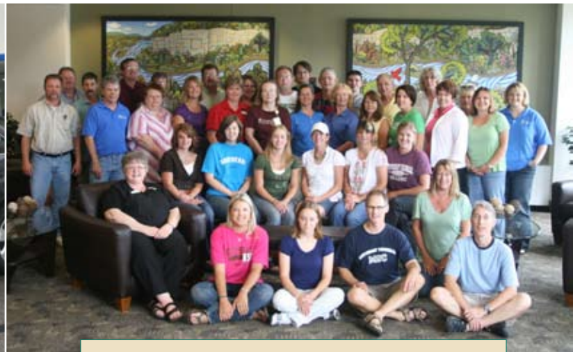
Southeast Technical, Winona and Red Wing