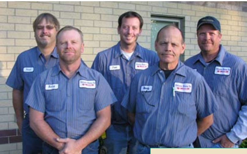
Sylvander Heating, River Falls, Wisconsin and Red Wing