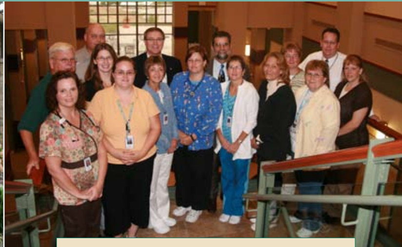
Fairview Red Wing Medical Center, Red Wing