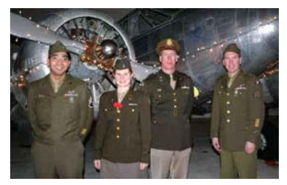
A group of dancers dressed in vintage clothing came from as far as the Twin Cities to participate in the 3rd Annual Hangar Dance.