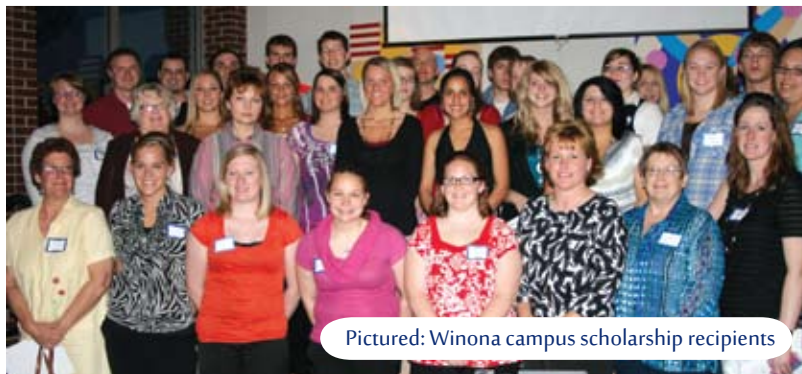
Pictured: Winona campus scholarship recipients