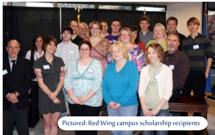
Pictured: Red Wing campus scholarship recipients

In the Spring of 2010, the 6th Annual Scholarship Banquets were held in Red Wing and Winona. The banquets celebrate the accomplishments of Southeast Tech scholarship recipients as well as the generosity of our donors. For the 2009-2010 academic year, 123 scholarships were awarded totalling over $110,000.