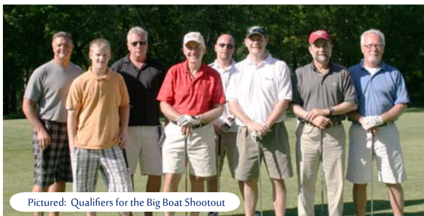
Pictured: Qualifiers for the Big Boat Shootout

The 2nd Annual Alumni and Friends Golf Tournament was held at Cedar Valley Golf Course in Winona, MN on August 2, 2010. Seventy-six Golfers rounded out the tournament which raised over $6,000 in scholarship dollars. Save the date for next year's tournament being held on Monday, August 1, 2011.