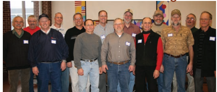
1976 Graduates and Instructors from the former Winona Vo Tech Farm Management Program