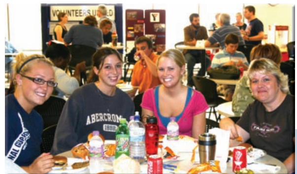
Red Wing Campus Welcome Back Picnic

Fifth Annual Welcome Back Picnics were held on each campus in September, welcoming all students, faculty, and staff back to school. Thank you to Steak Shop Catering for sponsoring the picnics and for the Alumni Society for hosting the event. Also, thanks to the 24 local vendors who participated. Over 1,000 plates of food were served.