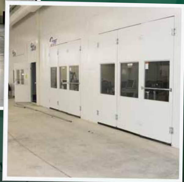
The new paint booths located in the Auto Body Collision Technology area.