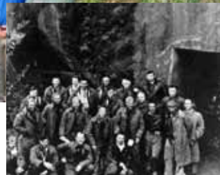
Doolittle and some of the raiders grouped outside the cave c. 1942.