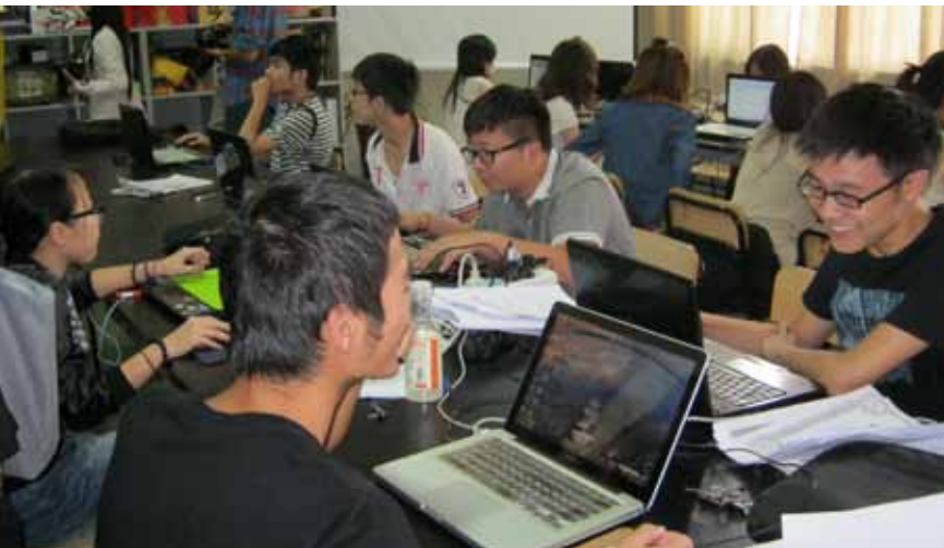
A graphic design class at the Quzhou College of Technology.

Though the primary purpose for this visit was to talk about education and the prospect for exchange, it also included cultural experiences, shared history and honoring of Confucius.