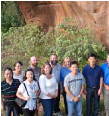
Visiting the military base and cave where Chinese farmers and villagers hid U.S. Pilots during WWII in an effort to keep the servicemen safe.

During WWII, the Chinese military assisted in the first ever U.S. mission to bomb Japan by opening their military base in Quzhou to U.S. pilots during the Doolittle Raids on Tokyo. Chinese farmers and villagers repeatedly saved and hid the airmen who crash landed in the mountains near Quzhou. These local residents kept the servicemen safe, even hiding them in a cave on the base, until they could return home. In the mid-nineties Red Wing hosted a reunion for the Doolittle pilots. This reunion not only included the U.S. pilots but also some of the residents from Quzhou who were instrumental in protecting the pilots. The airmen and residents saw each other for the first time in about 50 years. After this emotional reunion, Red Wing established Quzhou, China as a Sister City in recognition of this connection. During the trip to Quzhou, the Southeast Technical group visited this historical base and cave.